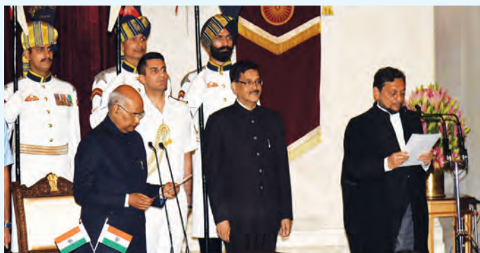
The President, Shri Ram Nath Kovind administering the oath of office to Justice Sharad Arvind Bobde, as the Chief Justice of India, at a swearing-in ceremony, at Rashtrapati Bhavan, in New Delhi on November 18, 2019.

Shri Justice Bobde, born on April 24, 1956, was enrolled as an Advocate on September 13, 1978. He started his practice at the High Court Bench at Nagpur and the District Court at Nagpur and occasionally at the High Court at Bombay and the Supreme Court of India in civil, constitutional, labour, company, election and taxation matters. He specialized in constitutional, administrative, company, environmental and election laws.