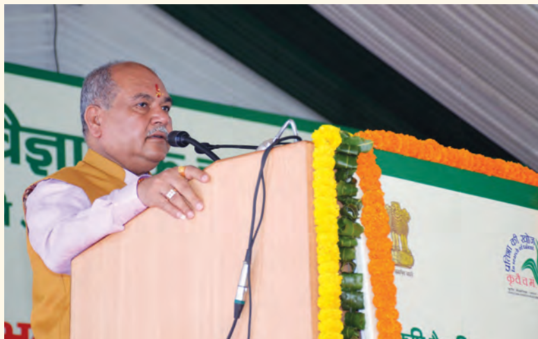
The Union Minister for Agriculture & Farmers Welfare, Rural Development and Panchayati Raj, Shri Narendra Singh Tomar addressing at the foundation stone laying ceremony of the office building of ASRB (Agricultural Scientists Recruitment Board), in New Delhi on November 04, 2019.

Laying the foundation stone for the new office building of Agricultural Scientists Recruitment Board (ASRB) at the Pusa Campus in New Delhi on 4 th November 2019, Union Minister for Agriculture Shri Narendra Singh Tomar said that the revamped ASRB will play a greater role in ensuring availability of capable and qualified Agriculture Scientists through a transparent and streamlined process. The Minister said Agriculture is important to the country and Government's aim is for the betterment of agricultural economy by ensuring increase in agricultural production, farmers' income and agricultural exports. This aim requires hard working farmers, proper training of farmers, availability of high quality seeds, better equipments, awareness of farmers for judicious use of fertilizers etc. But along with all these, the valuable contribution by the agricultural scientist is also significant in fulfilling this aim. To ensure this aim ASRB has its important role in providing ample, able, qualified agriculture scientists at proper time ensuring their proper recruitment process and promotion.